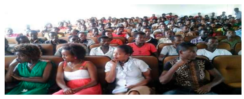
Participants were attending conference