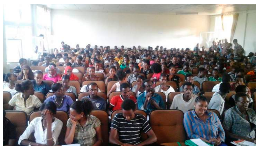
Participants were attending training

questioning and answering. In generally, the approach was participatory. To advocate child rights, big banner was prepared and posted in the training hall and outside of the hall. Training was given with collaboration of the former change agents. Moreover, Posters, pamphlets and training materials were distributed. 188 Males and 103 females and totally 291 participants were participated in training workshop.