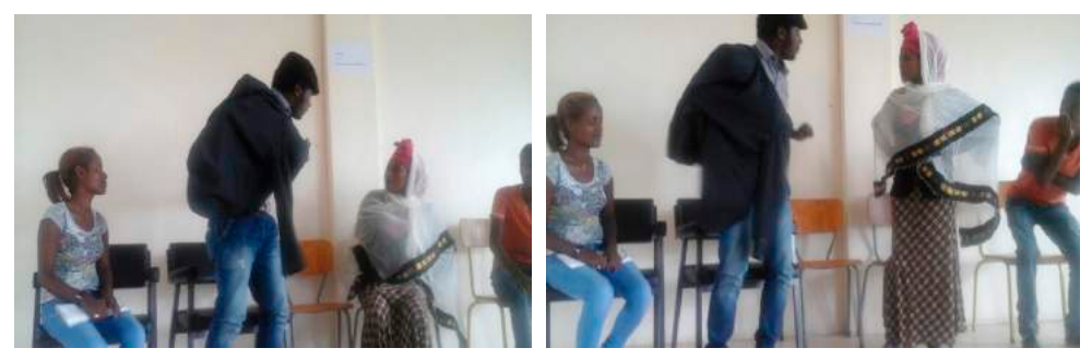
Child right club members were playing drama that focus on children treatment in famliy